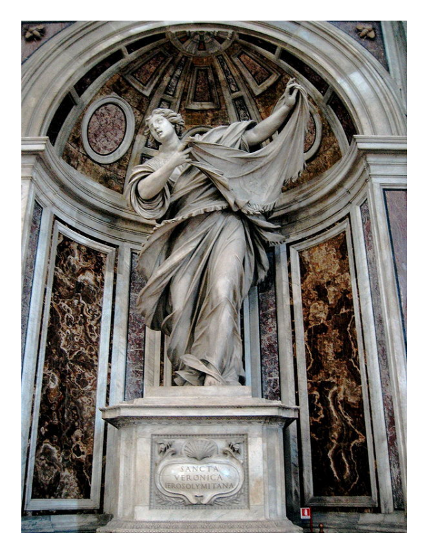
Statue of Saint Veronica by Francesco Mochi in a niche of the pier supporting the main dome of Saint Peter's Basilica.

that Christ gave her a portrait of himself on a cloth, with which she later cured the Emperor Tiberius. The linking of this with the bearing of the cross in the Passion, and the miraculous appearance of the image only occurs around 1380, in the internationally popular book Meditations on the life of Christ . <sup>[9]</sup> The story of Veronica is celebrated in the sixth Station of the Cross in many Anglican, Catholic, Lutheran, Methodist and Western Orthodox churches. <sup>[3][10][11]</sup>