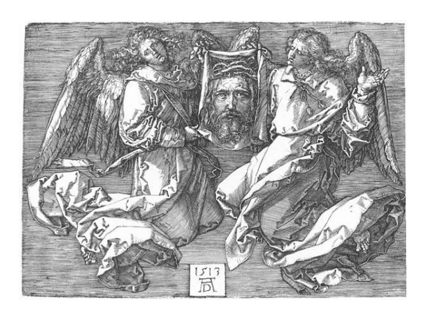
Albrecht Dürer's 1513 Veronica

that Christ gave her a portrait of himself on a cloth, with which she later cured the Emperor Tiberius. The linking of this with the bearing of the cross in the Passion, and the miraculous appearance of the image only occurs around 1380, in the internationally popular book Meditations on the life of Christ . <sup>[9]</sup> The story of Veronica is celebrated in the sixth Station of the Cross in many Anglican, Catholic, Lutheran, Methodist and Western Orthodox churches. <sup>[3][10][11]</sup>