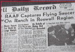
The front page of the Roswell Daily Record, July 8, 1947.

We've seen this done in a lab. The technologies for tapping this energy have already been fully developed within rogue and covert programs. Lockheed Skunkworks has enormous ships zipping around that are [powered by] anti-gravity. A lot of the UFOs sighted in the high desert of California and Utah are actually man-made prototypes.